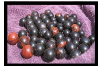
Mini Spheres made from Obsidian

Contact us for your custom lapidary needs. If we can't do something we will tell you straight up,