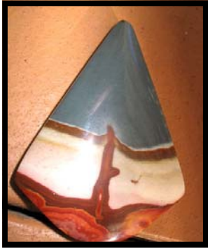
Royal Savannah Jasper

“Jasper, it’s been used for thousands of years as a gemstone...”